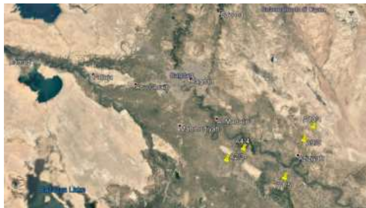
Figure 2. Location of samples collected in the Dalmaj and Nahrawan paleochannel sites (Altaweel et al., 2019).

The two samples collected in the Nahrawan site (A9/3, A10/4) have very high carbonate grains (but lower dolostone/total carbonate ratio) and much more abundant chert than Dalmaj sands. Shale/slate and siltstone/metasilstone grains are locally very common. Moderately poor heavy-mineral assemblages include more Cr-spinel and a little more epidote and prehnite. The higher HCI index reflects common presence of kaersutite and oxy-hornblende.